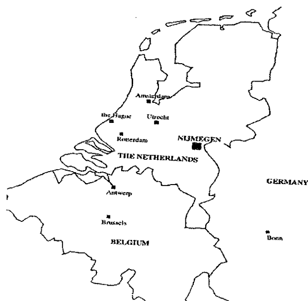
Illustration 1.1 location of Nijmegen in the Netherlands

The case study, discussed in Chapter Six, looks closely at the particular partnership structure chosen, the motivation for choosing this form of relationship, and the benefits from this relationship for the partners. This project is considered to be a success based on many criteria, financial, social, and physical, but there are many lessons to be learned from the experience (see Chapter Seven). With the experience gained from these lessons, the municipality is now implementing new instruments in the partnerships in which it is presently involved (Chapter Eight).