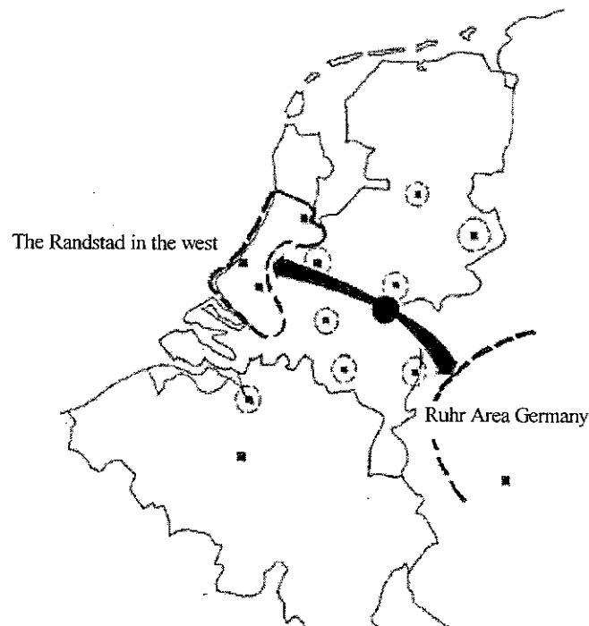
Nijmegen as a focal point between the west and the east